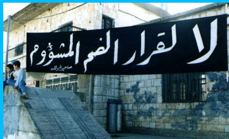
Above (right): A banner used during demonstrations against the Israeli annexation law.