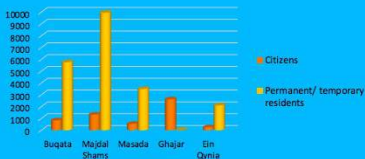
Number of Syrians with residency status and Israeli citizenship per village

While some young Syrians are willing to play this ‘game’ in order to exercise their fundamental rights, others recognise that exercising such a right could come at a high price: the legitimisation of Israel’s occupation and the loss of their Syrian identity.