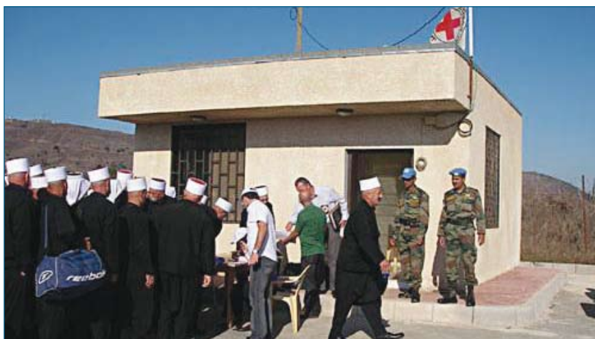
Figure 18: Qunaytra Checkpoint, 24 September 2009. Religious Druze men are checked before crossing the ceasefire line into Syria. On this day 560 religious Druze men were permitted to cross.