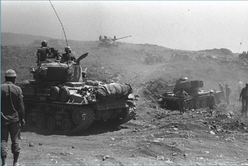
Figure 4 : Arab-Israeli War, 1967. Israeli tanks advancing through the Golan.

other Arab states. 23 As a result the Golan fell under Israeli military control. Almost immediately, Israel began a process of moving Jewish settlers into illegal settlements that it was building across the occupied region. 24