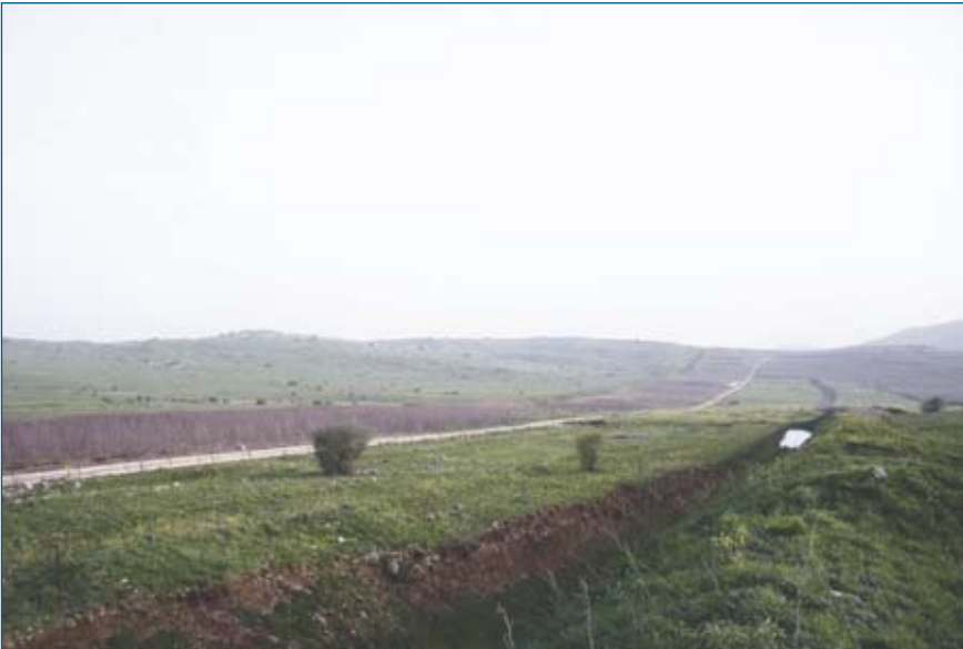
Figure 6 : South of Majdal Shams, Occupied Syrian Golan. An example of land expropriated by the Israeli authorities. To left of the picture are orchards owned by a Syrian national of the Occupied Golan. However, access to his land is prevented by a tank ditch and a stretch of land covered with landmines.

Israel has taken full advantage of the fact that individuals are not present to protect their land by expropriating land through declaring it 'abandoned' 27 or 'governmental' property. 28 This land has since been used for military use and to facilitate the creation and expansion of illegal Jewish settlements. In addition to this Israel has put in place a sustained process of controlling the Golan's rich water resources.