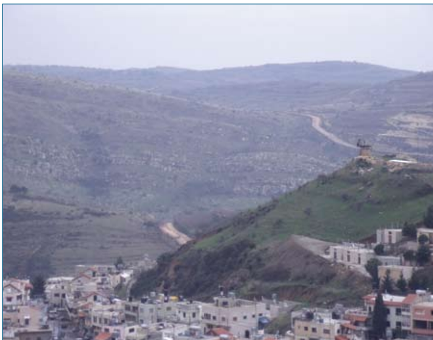
Figure 3 : Israeli Soldiers Watch Over Majdal Shams, Occupied Syrian Colan.

In 1967 another Arab-Israeli War broke out between Israel and Syria. Israel emerged triumphant and the occupant of Arab territory, including the Golan, despite Syria having the backing of Jordan, 20 Russia, 21 Egypt 22 and eleven