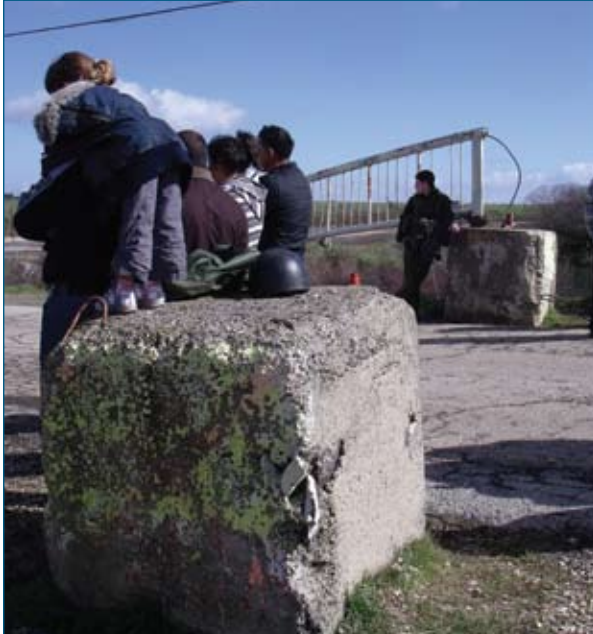
Figure 25: Qunaytra Checkpoint in the Occupied Syrian Golan. Family members wait anxiously for the return of their relatives from Syria as an Israeli soldier looks on. Is this really how families who simply want to see each other should be treated?

A number of welcomed measures have been taken over the last twenty years in relation to families gaining access to Syria. However, this process remains discriminatory, inconsistent, unpredictable and ultimately unsatisfactory. Putting aside the emotional turmoil and torture that such regulations and policies are putting families through on a daily basis, this process is causing gross violations of international human rights and humanitarian law. These violations and the best ways to remedy and prevent similar violations in the future will be explored in the next sections of this report.