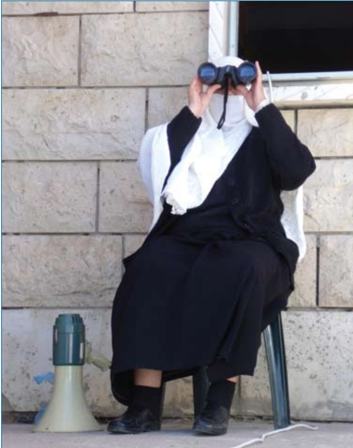
Figure 15: Valley of Tears, March 2010. A woman from Majdal Shams, Occupied Syrian Golan waits her turn to communicate with her family by megaphone.

For family members, such as those in Damascus, Syria, who have to travel up to 60 kilometres each way, visiting the Valley of Tears can be a time consuming exercise. Moreover, in the early days it was reported that the army intentionally drove along the middle of the Valley of Tears using their vehicles to create a dust storm and sounding their alarms to make