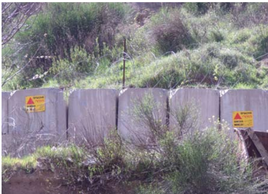
Figure 32: Majdal Shams, Occupied Syrian Golan. Concrete blocks have had to be placed at the bottom of a hill expropriated by the Israeli forces for military purposes in the middle of Majdal Shams. This hill is covered in landmines which have been shifting their positions due to natural erosion and heavy rainfall. These concrete blocks are necessary for preventing the landmines from sliding into civilian homes and gardens.

crops. The Israeli authorities also began a process of expropriating land under the guise of military purposes. Not only was the land expropriated but the Israeli forces destroyed the cities, towns, villages and farms that stood on such land as they went along. Consequently, the Israeli forces inaccurate spin on the situation and dishonourable use of their weaponry resulted in the Golan people having 70% of their land illegally taken by force and without compensation.