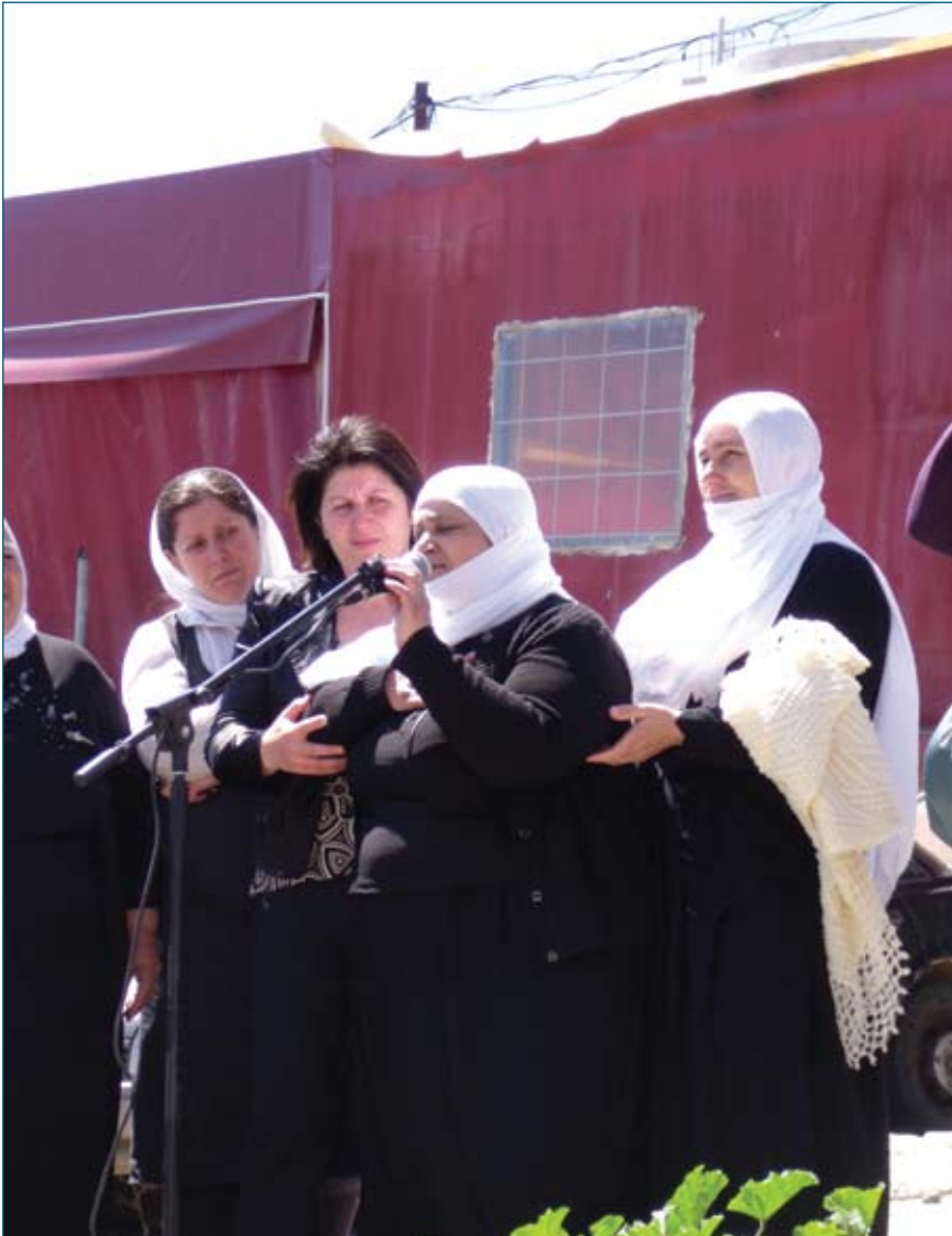
Figure 34: Valley of Tears, Mother's Day 2010. A woman from Majdal Shams, Occupied Syrian Golan becomes so upset while being wished Happy Mother's Day via loudspeaker by her child on the Syrian side of the Valley that she has to be held up.