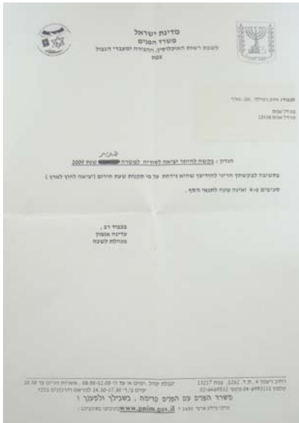
Figure 23: A copy of a letter informing Jamela Nayf Ayoub her application to visit Syria for religious reasons in 2009 was denied. Following a later application in the same year Jamela received a permit allowing her to make her first visit to Syria. She has been waiting forty-three years to be able to do so.

“Women have as much right to visit Syria as students and religious men... it is a basic human thing to be able to see loved ones.”