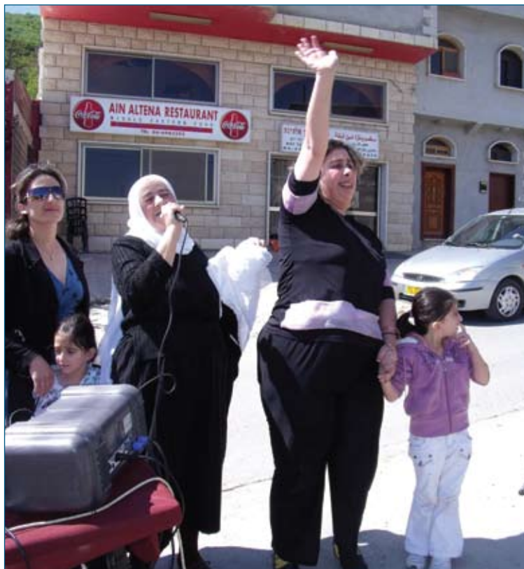
Figure 31: Valley of Tears, March 2010. A woman sends messages across the Valley of Tears to family for all to hear.

be confused.” 125 It has come to light that Israel’s regulations are imposed on the basis that the authorities are unable to decipher who is a security risk and who is not. 126 This amounts to disproportionate discrimination which has been used as a basis to introduce policies which cause unjustified and unbalanced violations of the right to privacy.