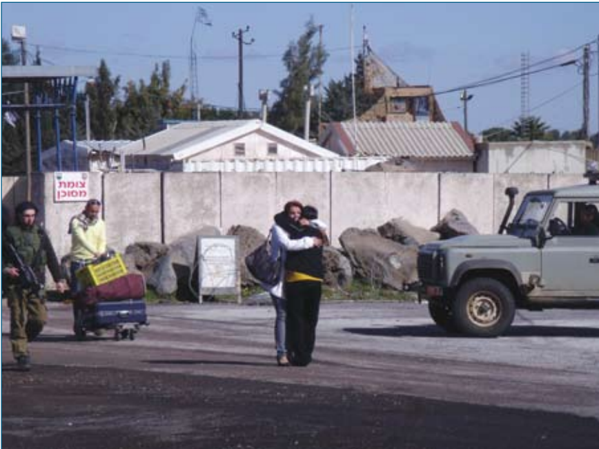
Figure 19: February 2010, Qunaytra Border in the Occupied Syrian Golan. Students enjoy an emotional reunion with family after returning home from studying in Damascus, Syria.

Students have been travelling to Syria with the help of the ICRC since 1994. This process was initially introduced in 1977, but was only in operation for a short period of time. The students travel across to Syria at the start of the academic year and return at the start of their summer holidays. Initially they are permitted to do so for three years, but if their degree is longer than this they can apply to have their access extended to the duration of their studies. Once their studies are finished they then have to make the choice of whether to remain in Syria or to return to the Occupied Golan.