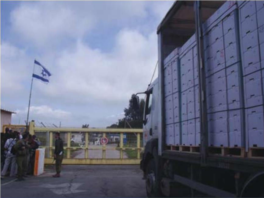
Figure 24: 2 March 2010, Qanytra Checkpoint in the Occupied Syrian Golan. An ICRC truck loaded with Golan apples about to cross from Israel Occupied Territory, into the DMZ, to then continue its journey into Syria.

There is also the issue that once a year for the last five years Golan apples have been permitted to cross the Syrian ceasefire line. In 2010 10,000 tons of apples were transported to Syria over two months.