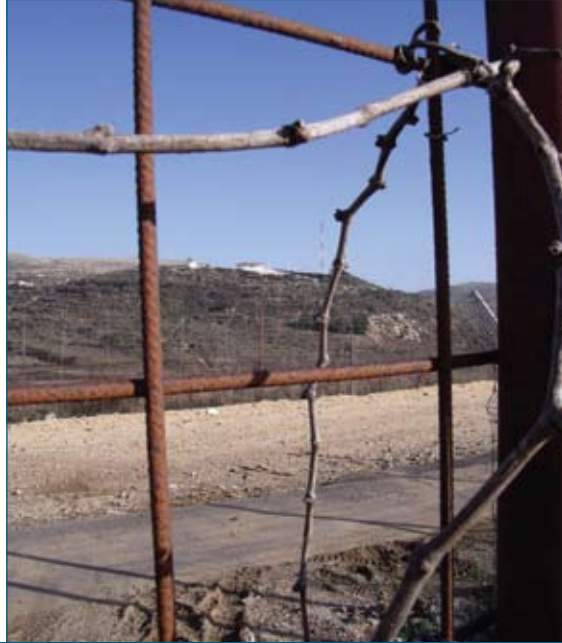
Figure 8 : East Border of Majdal Shams, Occupied Syrian Golan. Just one of the many fences which deny freedom of movement and stand between the Syrians still based in the Golan and their families in Syria.

The current situation in the Occupied Golan is difficult for Syrians. Even though the 1982 strike was initially a success, the Israeli authorities have since imposed a form of Israeli nationality upon those who reject Israeli citizenship. The situation is similar to that experienced by the Palestinian Arab residents in Occupied East Jerusalem who have been given permanent residency under Israeli jurisdiction. Yet while Palestinian Arabs residing in East Jerusalem are permitted to have Jordanian nationality, the indigenous population of the Occupied Golan are recognised as having an 'undefined' nationality and are only awarded an Israeli Laissez-Passer. Those that have been assigned this status face daily challenges in terms of freedom of movement, discrimination and family separation which all amounts to a violation of international humanitarian and human rights law.