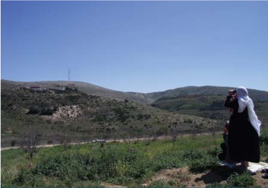
Figure 33: Mother's Day 2010. A woman and her daughter on the Occupied Golan side of the Valley of Tears try to locate their relatives on the Syrian side.

Thirdly, a number of people are being prevented from continuing their studies in Syria on the basis of 'security reasons'.