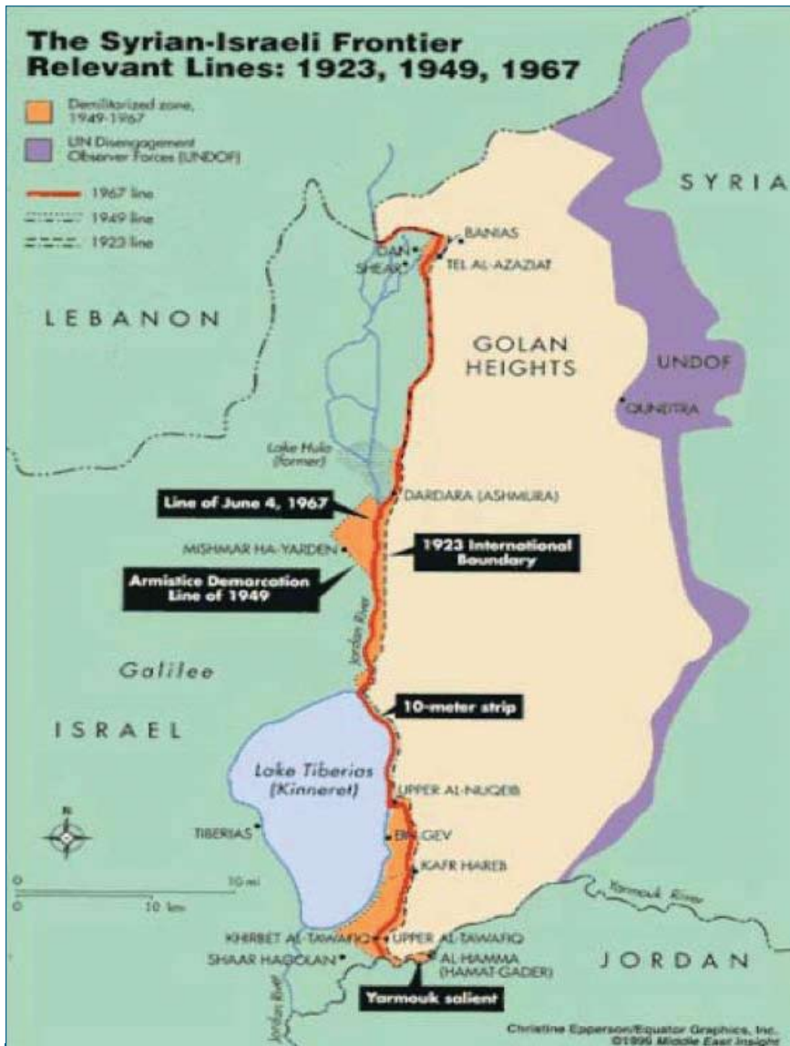
Figure 1 : Sourced from Middle East Insights