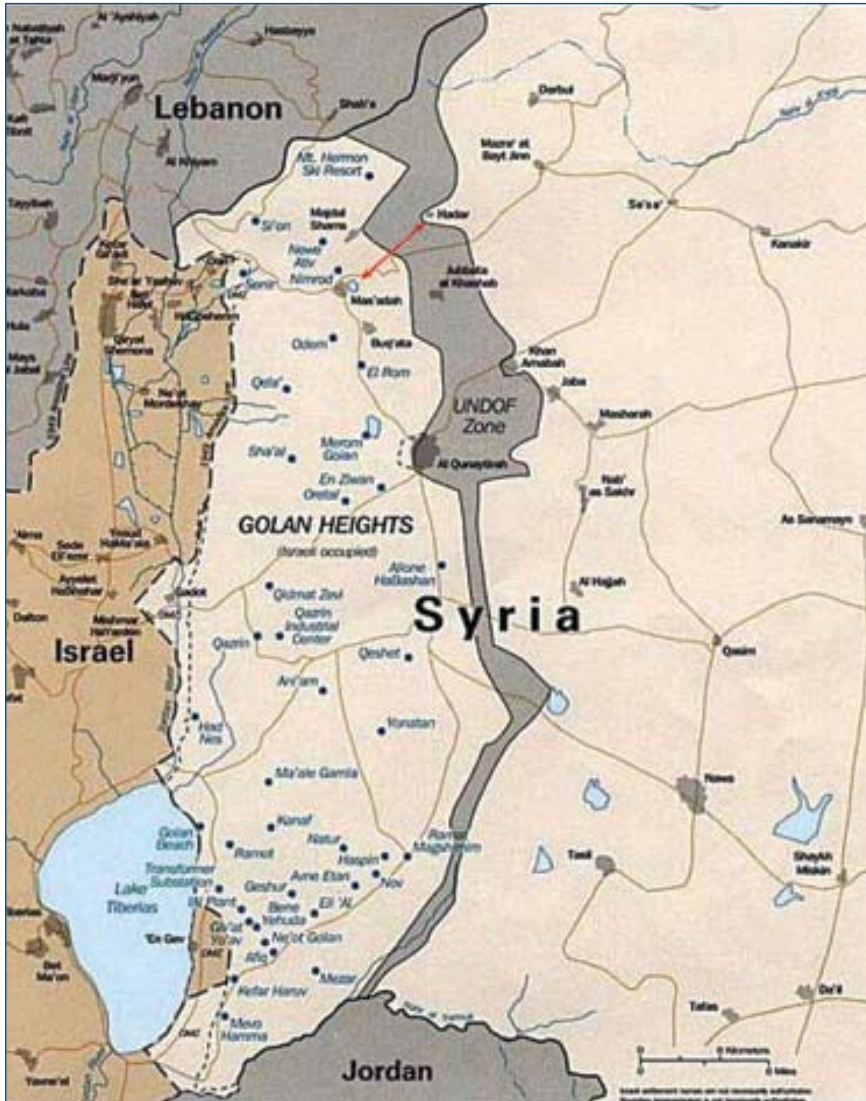
Figure 13 : Map showing the distance between Masa'da, Occupied Syrian Golan where Roeda currently lives and Hadar, Syria where her family Syria are based. It is a distance of less than 20 kilometres.