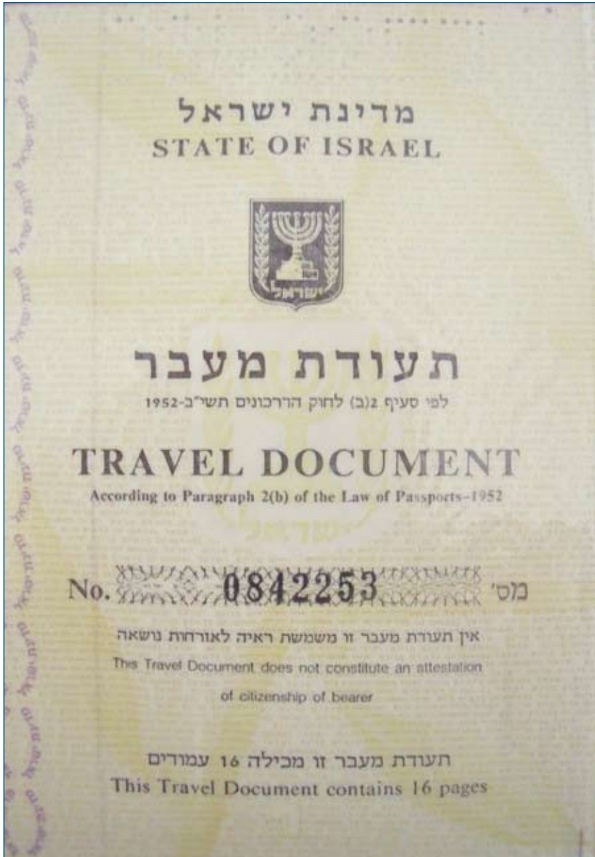
Figure 11 : Front Cover of an Israeli Laissez - Passer.