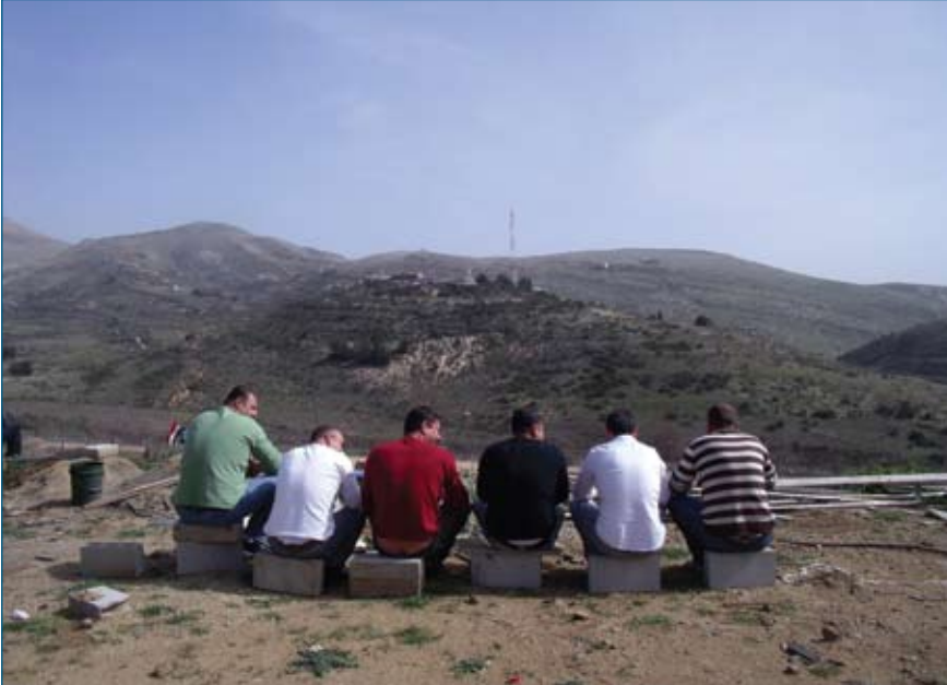
Figure 16: 14 February 2010, Majdal Shams in the Occupied Syrian Golan. Locals and their family members in Syria gather at the Valley of Tears at an annual demonstration to commemorate the 1982 strike.