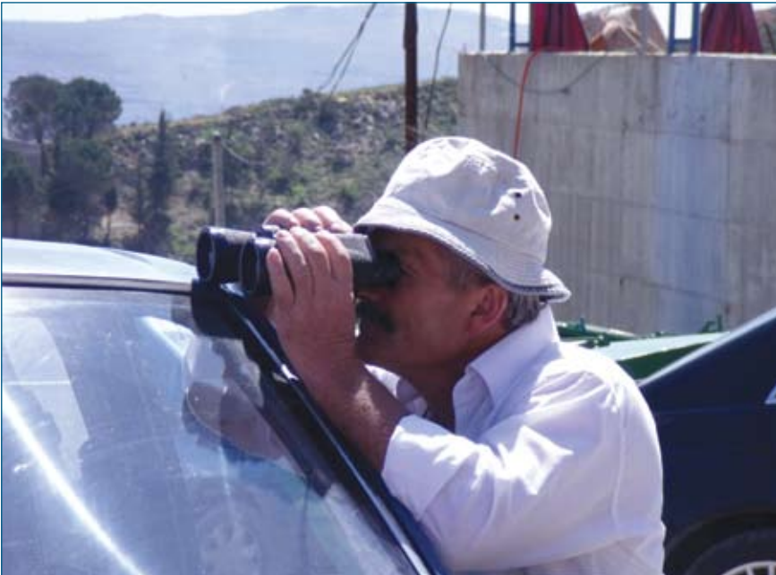
Figure 14: Majdal Shams, Occupied Syrian Golan. A man watches his family on the Syrian side of the Valley of Tears.

Following this an area 200 metres was marked out by Israel with the use of fencing and landmines. This area has become known as the Valley of Tears. It is located at the Syrian ceasefire line along the east side of Majdal Shams in the Golan. It is here that families meet and communicate with each other with the aid of megaphones and binoculars.