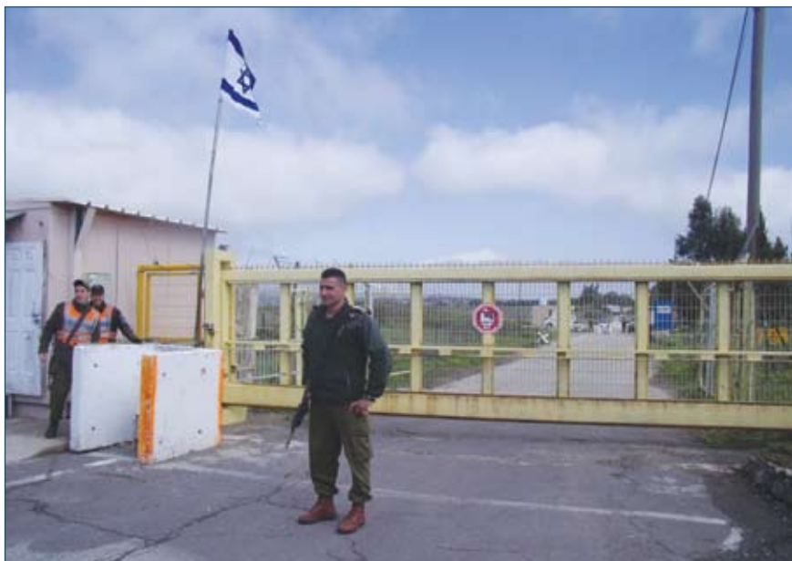
Figure 29: Qunaytra Border, Occupied Syrian Golan. Laws, regulations, soldiers, fences and landmines stand in the way of the freedom of movement of the natives of the Golan.

Furthermore, the issuing of Israeli Laissez-Passers stating 'undefined' nationality has resulted in unjustified scrutiny and at times refusal of passage for their possessors. Only 'religious Druze men', 'non-religious men over 35', 'women over 70', 'students' and 'apples' are permitted to cross the Syrian ceasefire line. Even those who fall into these categories are not guaranteed a permit and are subjected to a discriminatory and selective application process. Israel's justification for such policies is that this group poses a security risk. However, the case Adalah, et. al v Minister of Interior et. al exemplifies Israel's tendency to an unjustifiable 'better safe than sorry' approach. 121 Consequently, Israel's treatment of the natives