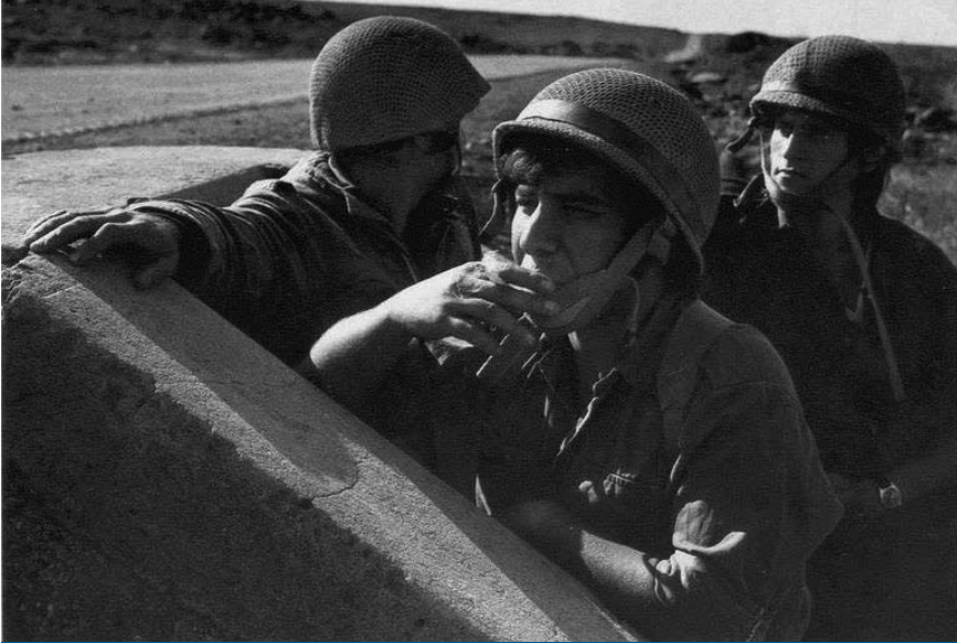
Figure 5 : Israeli Soldiers patrolling the Golan in 1973.

In 1981 Israel ended its military rule of the territory with the enactment of the 'Golan Heights Law'. This legislation purported to annex the occupied territory to the state of Israel. It extended Israeli law and administration throughout the region and attempted to make the Syrian population of the Golan renounce their Syrian citizenship and become Israeli citizens. This move continues to be denounced by the international community 25 and the indigenous Syrian population voiced their opposition with a six month general strike in 1982.