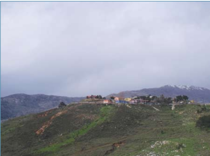
Figure 12 : Nimrod Settlement in Northern Occupied Syrian Golan built on the expropriated land without compensation for the rightful owners. There are plans to expand this settlement which would result in further expropriation of land which rightfully belongs to natives of the Golan.

In addition, the creation of illegal Jewish settlements within the Occupied Syrian Golan creates a further issue with regard to the legality of Israel's occupation of the region. Article 49(6) states "the Occupying Power shall not deport or transfer parts of its own civilian population into the territory it occupies." In complete disregard for the obligations in this article, since 1967 33 illegal settlements have been constructed throughout the Golan for between 17,000 and 20,000 illegal settlers.