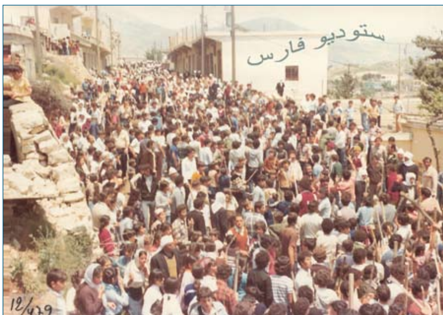
Figure 7 : Photo taken in Majdal Shams, Occupied Syrian Golan during the 1982 strike.

the Syrian population of the Golan. The conclusion of this meeting was the commencement of a general strike for an unlimited period of time. The strike was to continue until Israel suspended the 'Golan Heights Law' and stopped trying to force Israeli nationality upon the Syrians of the Golan. It included boycotting Israeli goods and an active rejection of Israeli security cards. 33