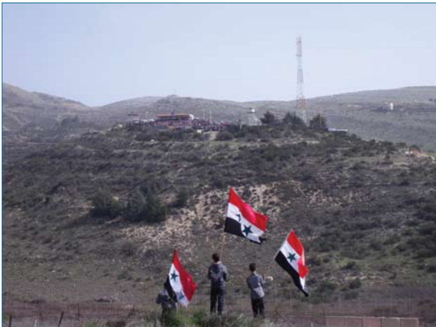
Figure 28: Valley of Tears on 14 February 2010. A group of boys from Majdal Shams, Occupied Syrian Golan celebrate their Syrian heritage with their counterparts on the Syrian side of the Valley.

The right to nationality is closely linked with the right to culture and right to self-determination. Through rejecting the Syrian nationality of the natives of the Golan people lose part of their identity and sense of belonging which makes the situation of family separation even harder. There is no justification for Israel's denial of the right to nationality for the Golan people, yet the Israeli authorities continue to actively violate this right and do so in a discriminatory and disproportionate way.