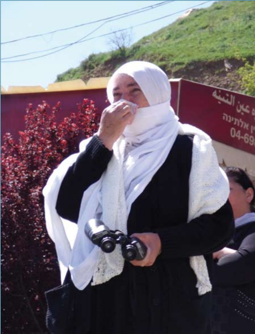
Figure 26: Valley of Tears, March 2010. A woman from Majdal Shams, Occupied Syrian Golan becomes very upset while watching her family on the Syrian side of the Valley.