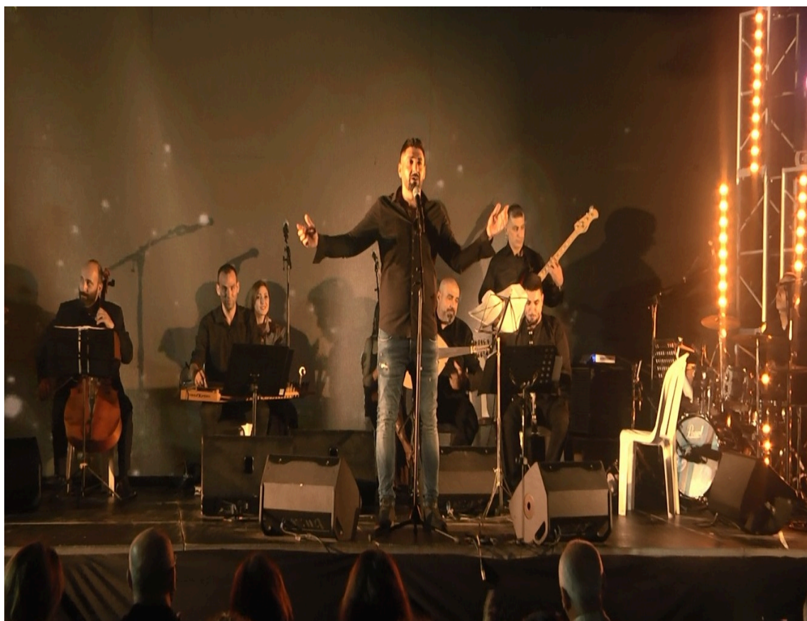
“Jawlan Cultural Days” – Closing ceremony