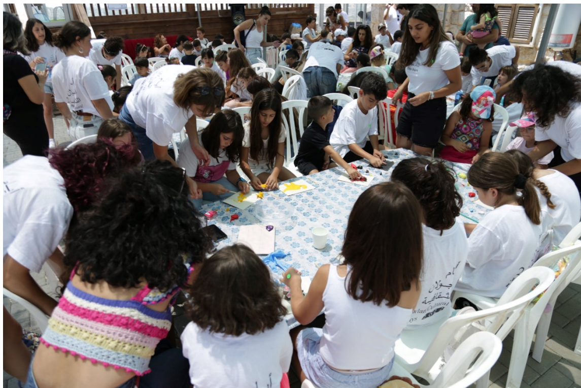
"Jawlan Cultural Days" Festival: Art workshop for children

"Golan Cultural Days - 2" is the second edition of the cultural festival organized by Al-Marsad in cooperation with local grassroots and partners. This year 2022, the festival's activities lasted over nine consecutive days and included theatre performances, discussion workshops, and musical evenings, in addition to an arts camp for children. Last year, young and university students volunteer had a significant role in organizing and running the festival. This year, there is a good turnout and local contribution to support the festival, in addition to the Palestinian assistance represented by the "Takatuf Grant" provided by the Abdul Mohsin Al Qattan Foundation.