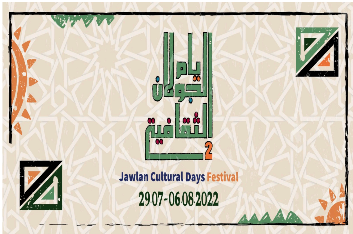
Jawlan Cultural Days: Main poster

Facebook page: https://www.facebook.com/Jawlanculturedays