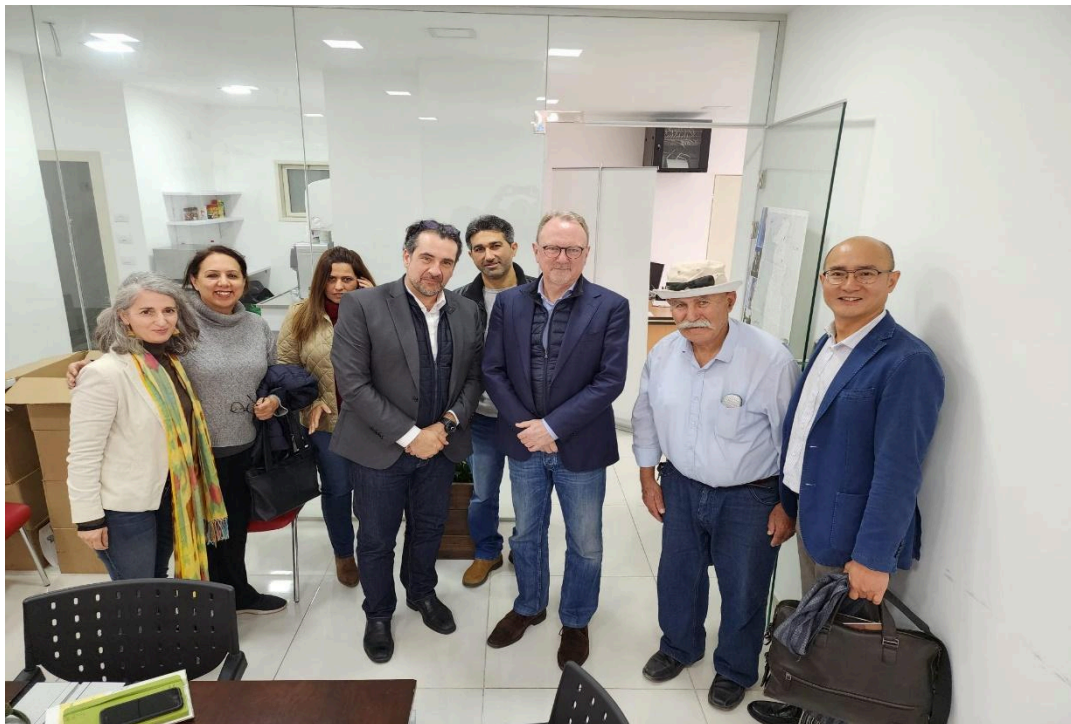
Work Meeting with the ILO - Al-Marsad offices