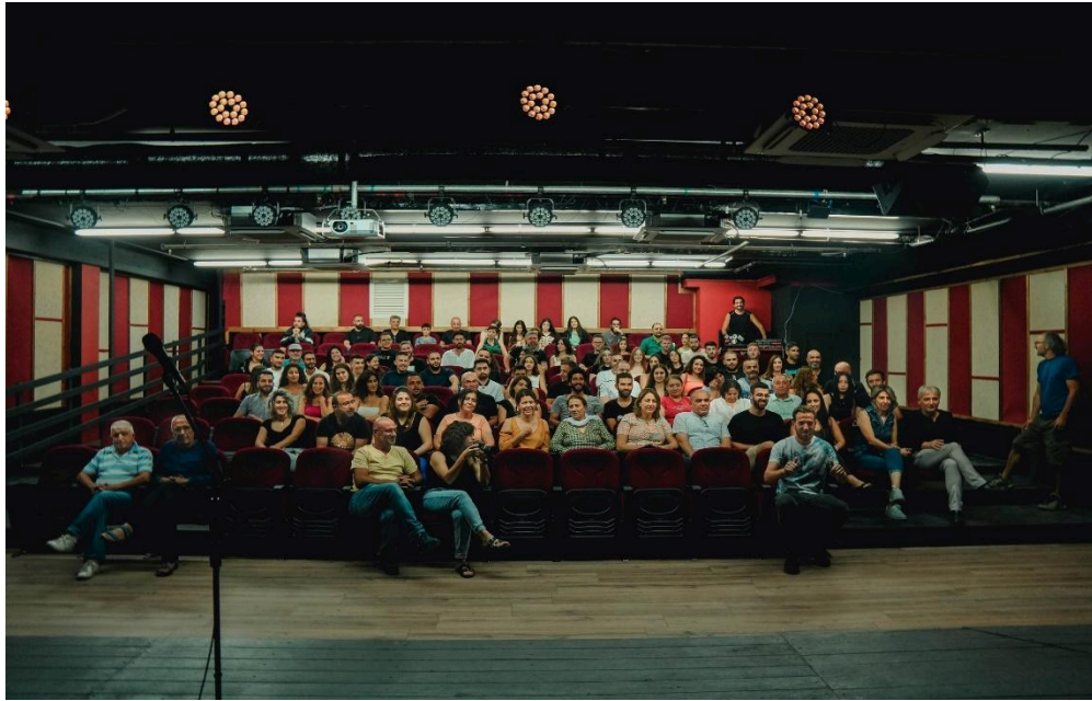
One of the seminars during the festival

links and documentation about the festival: Facebook