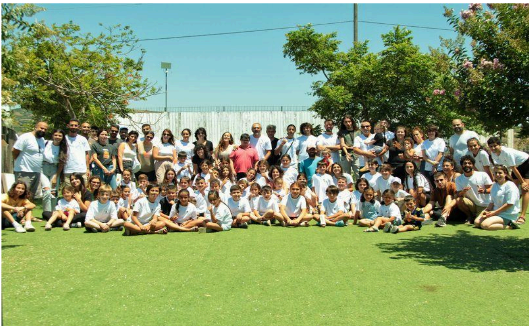
Festival volunteers and activists

This step will strengthen the sense of togetherness in our Jawlan, building hope and urging creative youth competencies to take action, influence, and make a change. We believe that the public space is not the preserve of the elite or any authority and that we deserve, as individuals and as a community, to celebrate qualitative cultural content that is available to all and respects our minds, away from the prevailing culture of consumption.