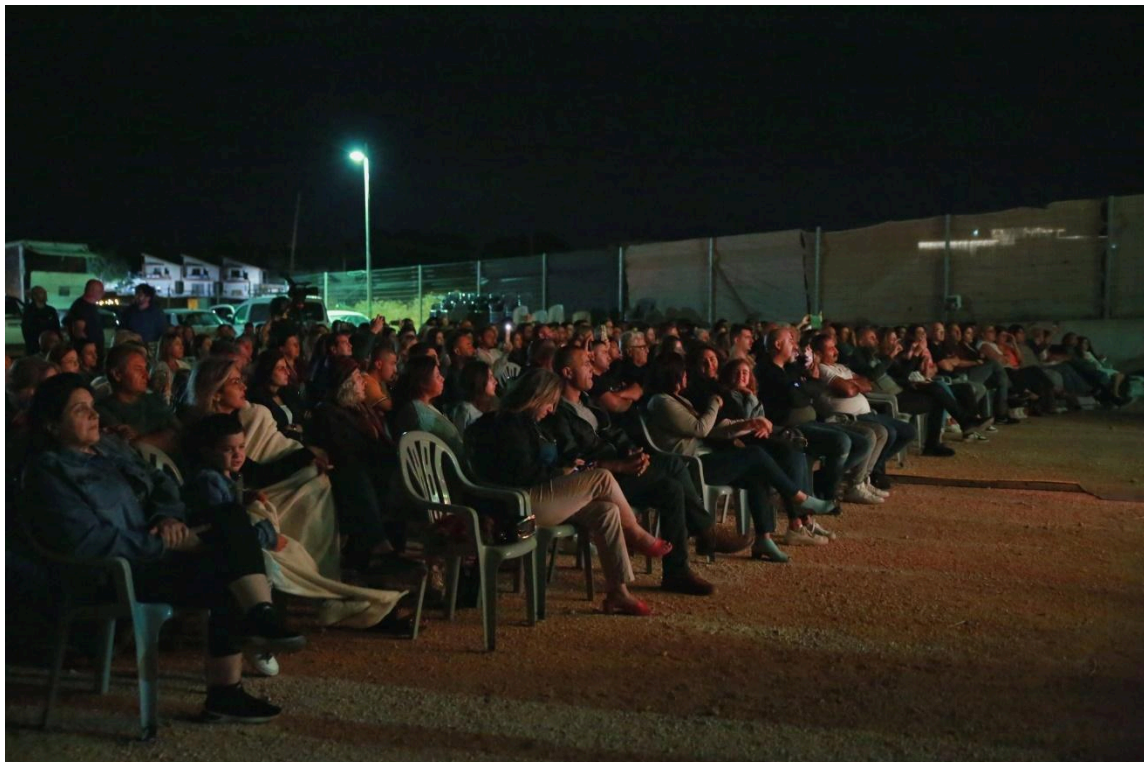
Golan Cultural Days (3 rd Cycle) July 30-August 6’ 2023

“Golan Cultural Days - 3” is the second edition of the cultural festival organized by Al-Marsad in cooperation with local grassroots and partners. This year, the festival's activities lasted over nine consecutive days, including theatre performances, discussion workshops, musical evenings, and an arts camp for children. Last year, young and university student volunteers had a significant role in organizing and running the festival. This year, there is a good turnout and local contribution to support the festival, in addition to the Palestinian assistance represented by the “Takatuf Grant” by the Abdul Mohsin Al Qattan Foundation.