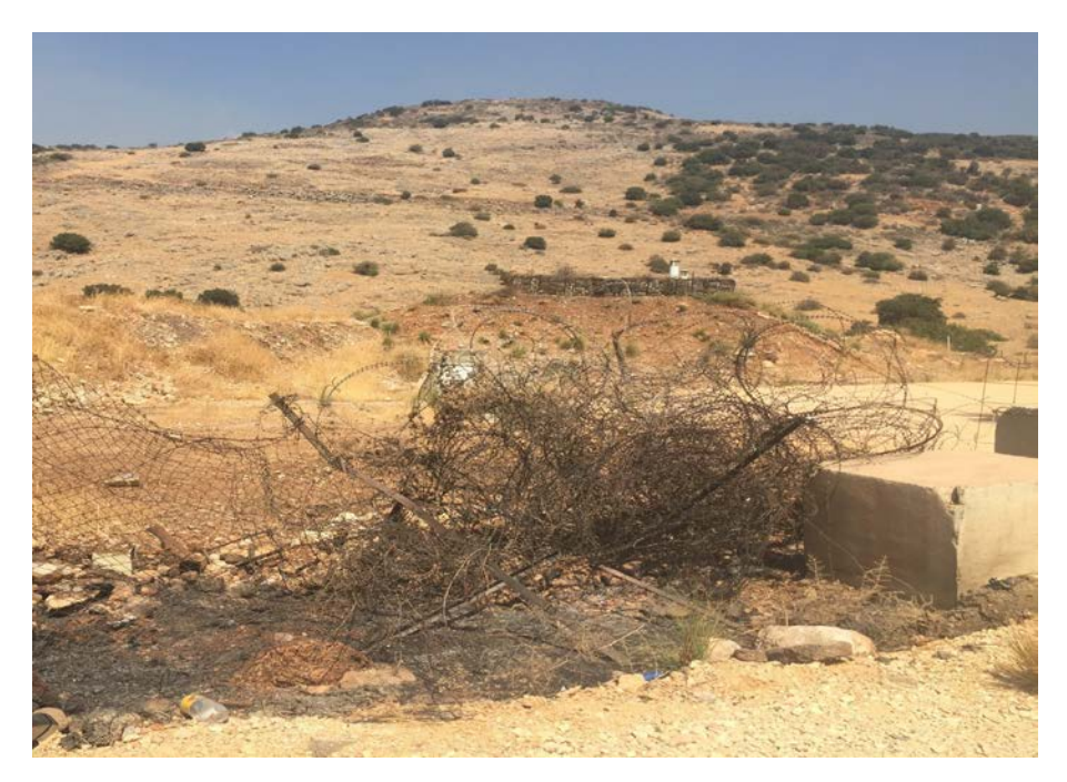
A broken fence surrounding a minefield

Even though many minefields in the Golan are marked, they continue to pose a grave danger to the villagers who live and work near them. On February 11, 2008, the Peace Court of the city of Haifa ordered the Israeli government to award NIS62,240 (USD $14,939) to compensate two brothers in Majdal Shams for the injuries they sustained in 2000, when landmines swept down a hill from a minefield into their courtyard. The court concluded that the Israeli Army was aware of the dangerous positioning of the mines but took no preventive measures.<sup>80</sup>